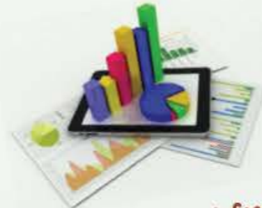
Statistics and feedback