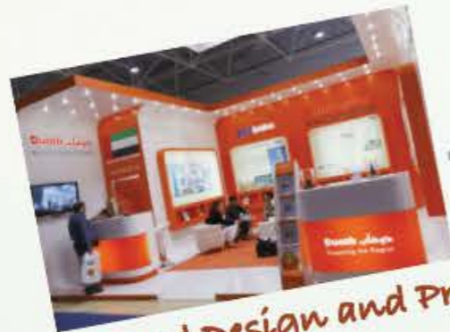
Stand Design and Production